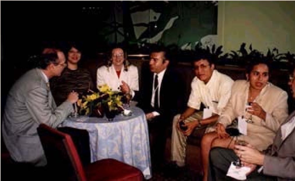
Regional Chapter Chair Congress